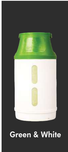
Green & White