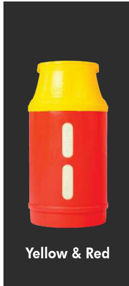
Yellow & Red