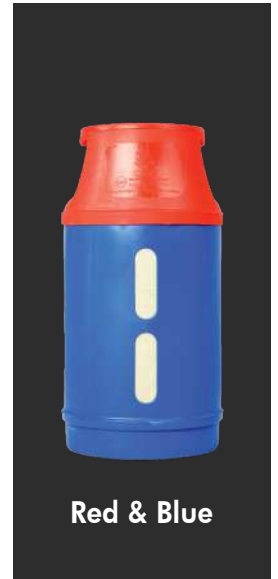
Red & Blue