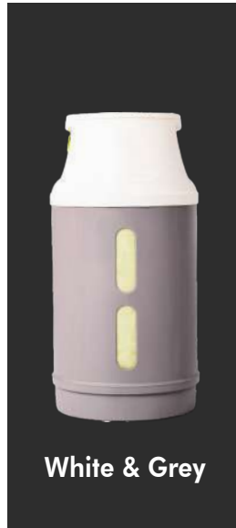
White & Grey